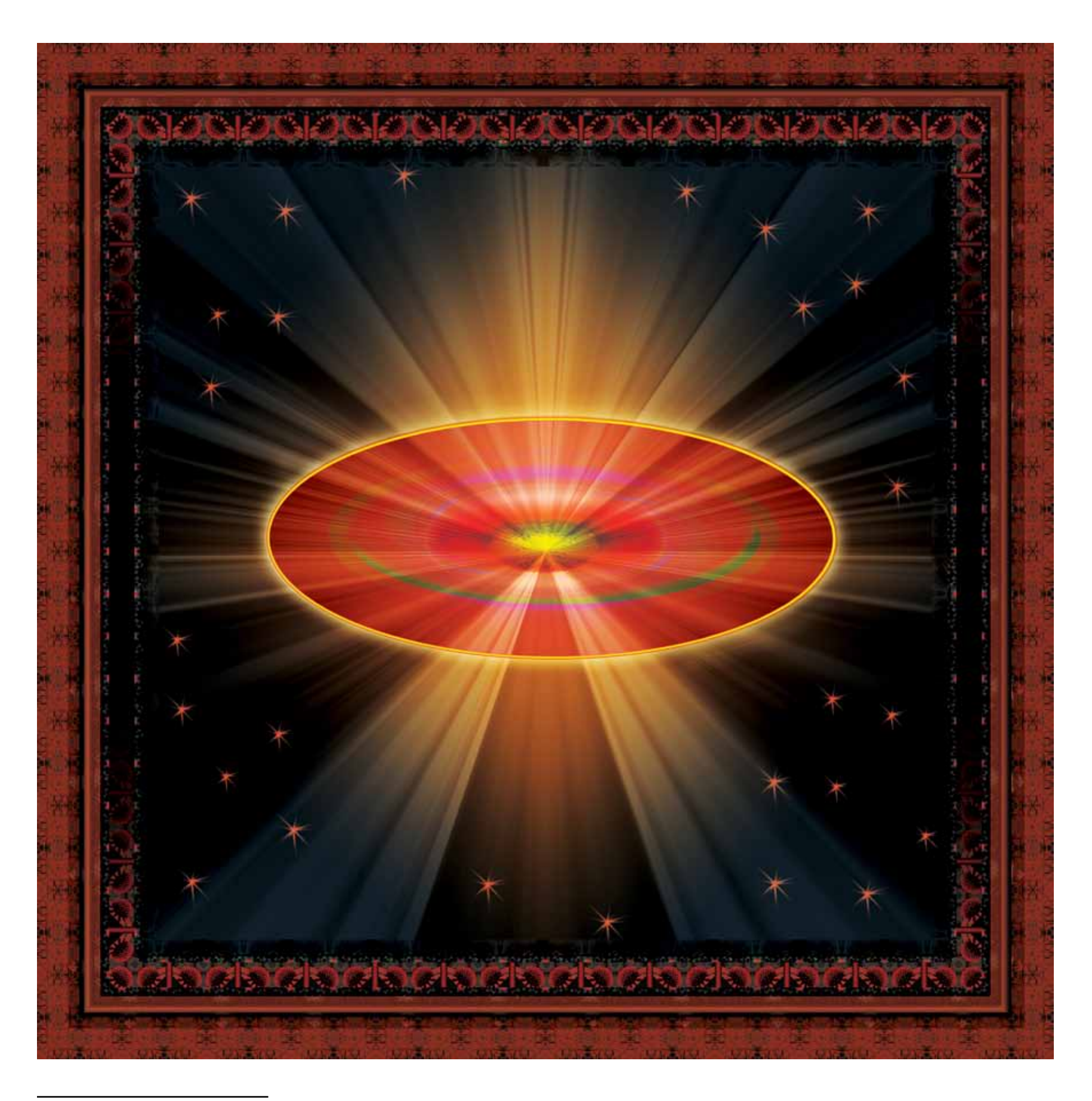
Fulfilling Our Destiny