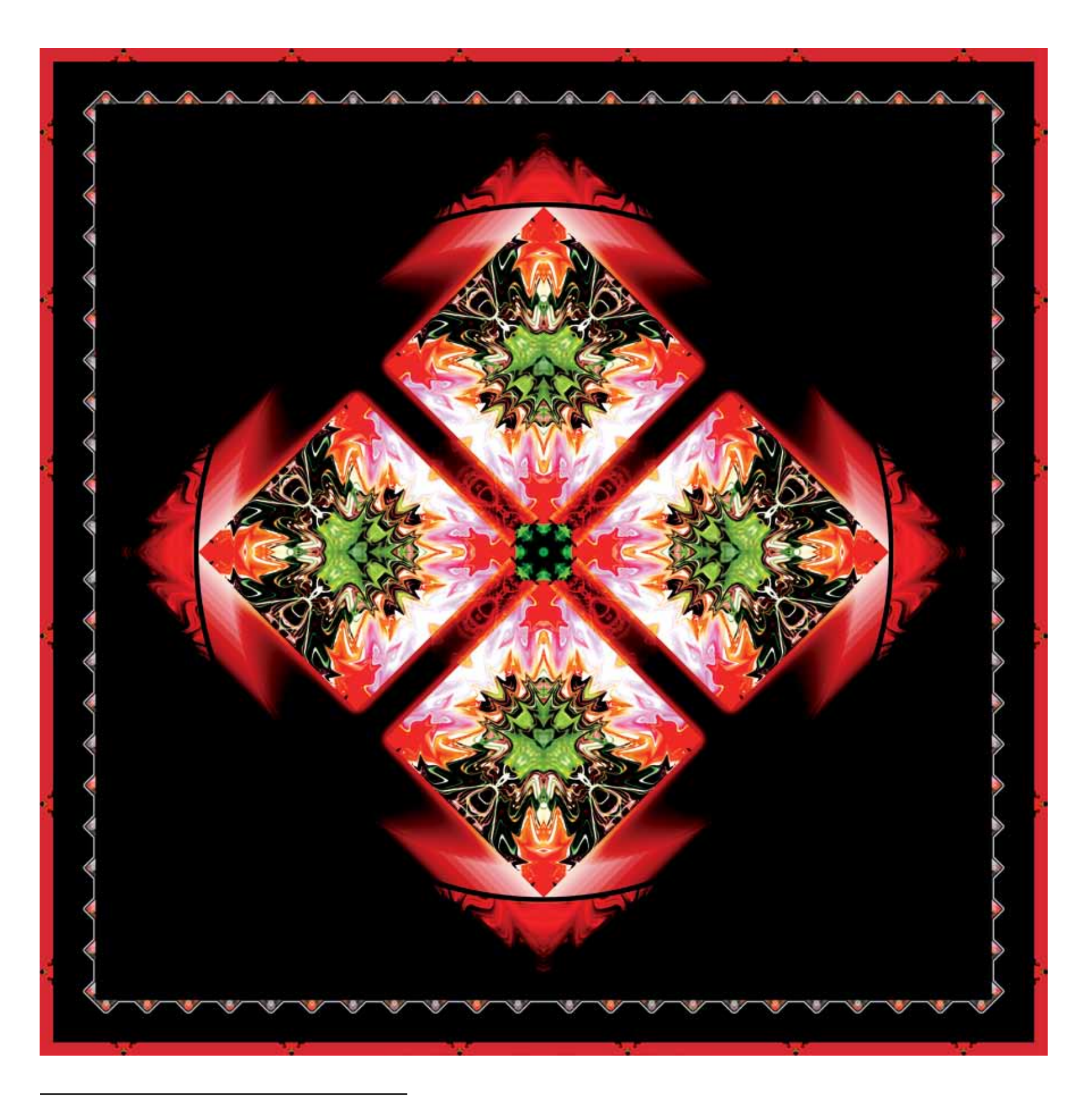
Merging with the Spirit of Amanita