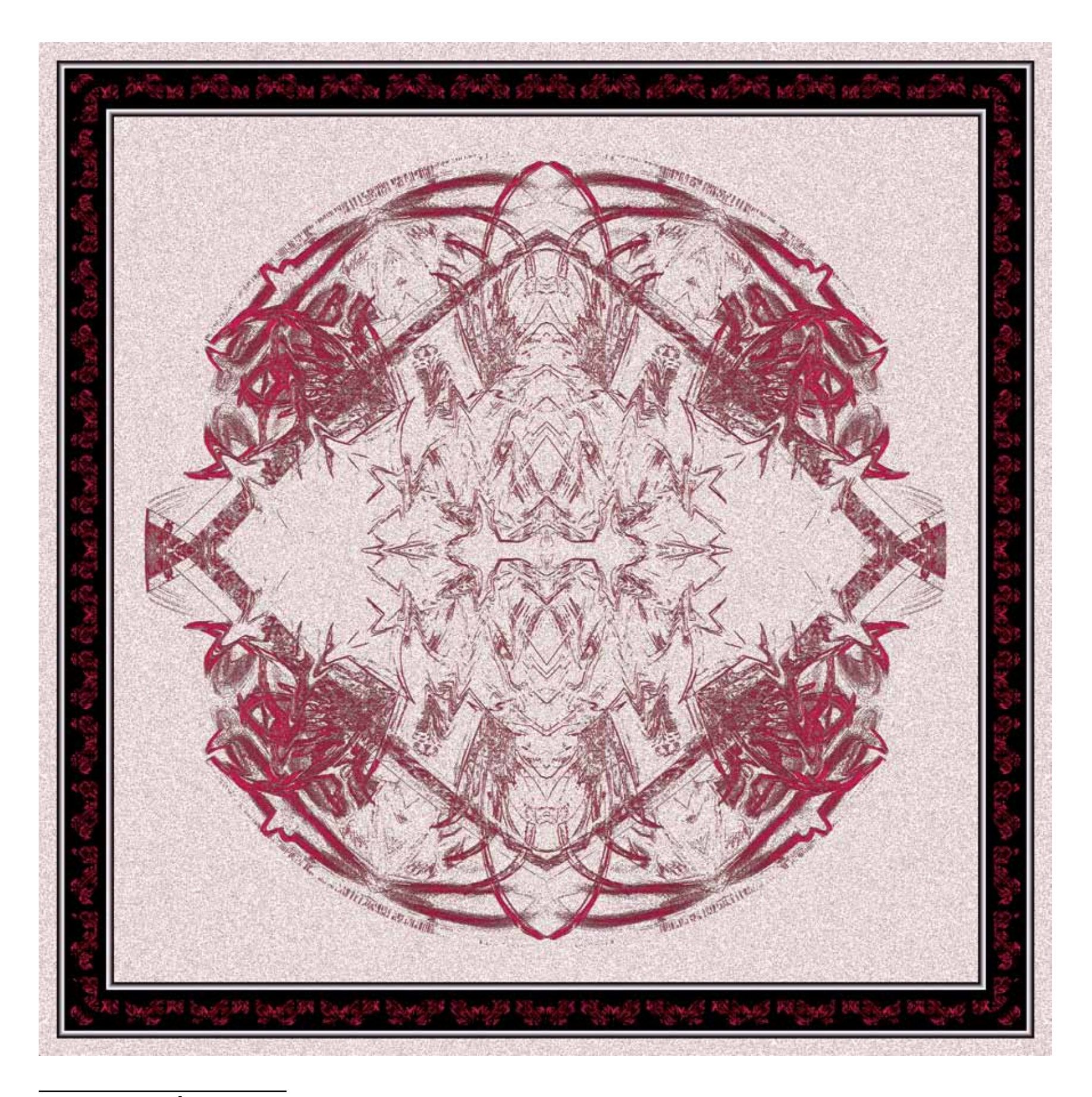
Unraveling the Mystery