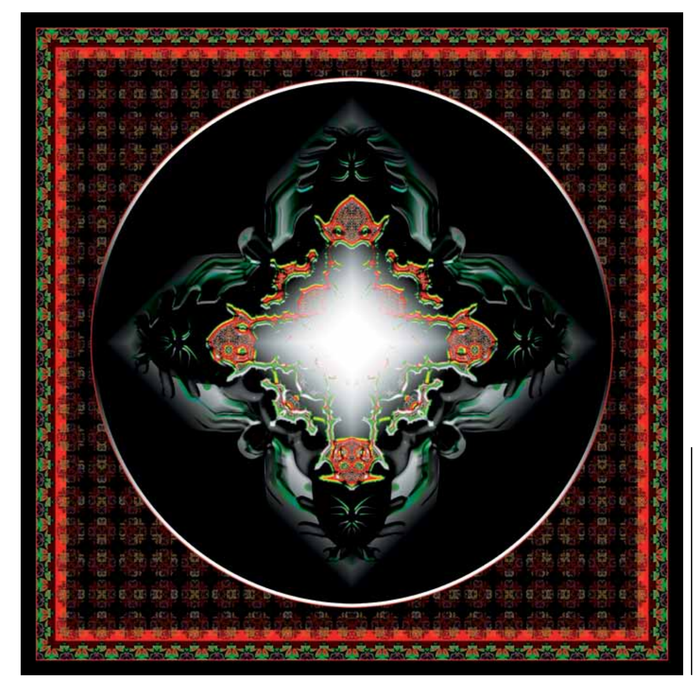
Expanding from the Source