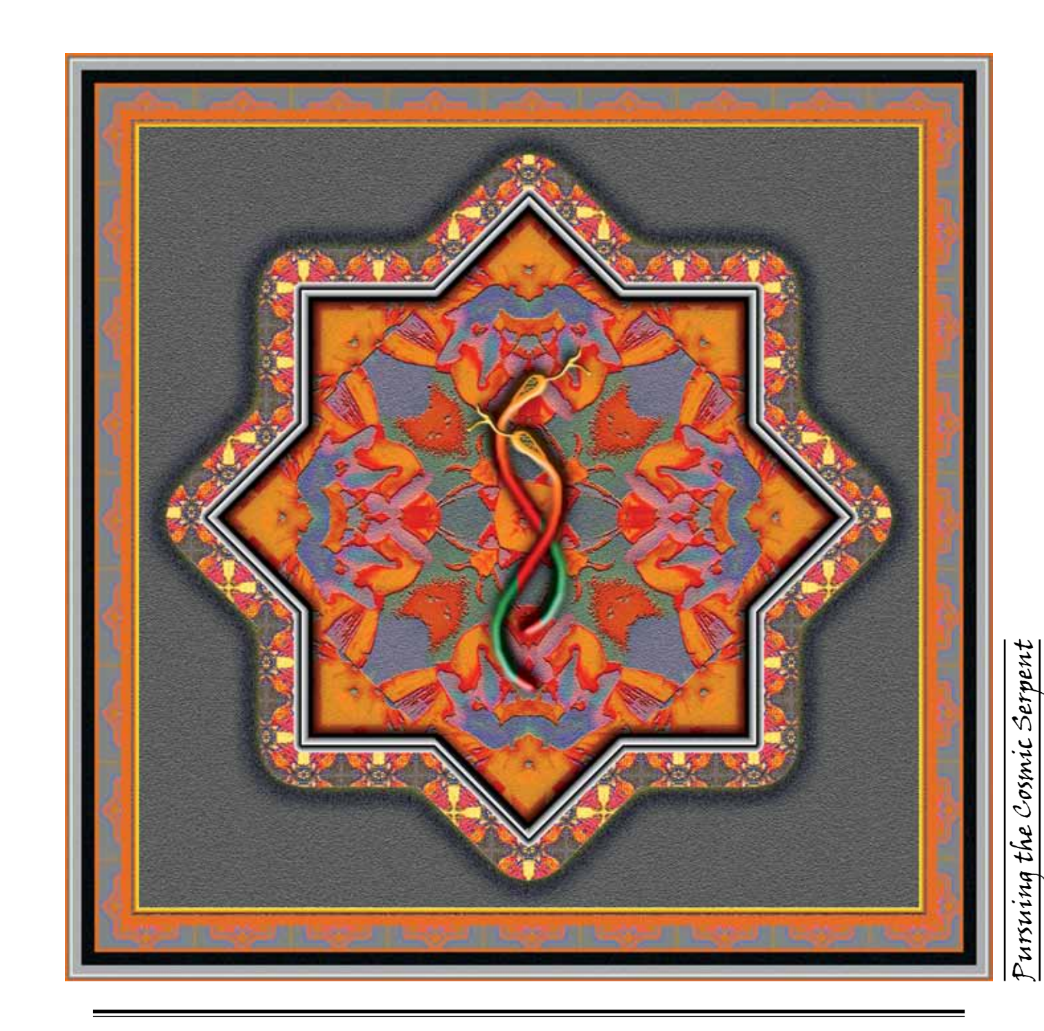
Chapter 3: A Personal Story of Realization